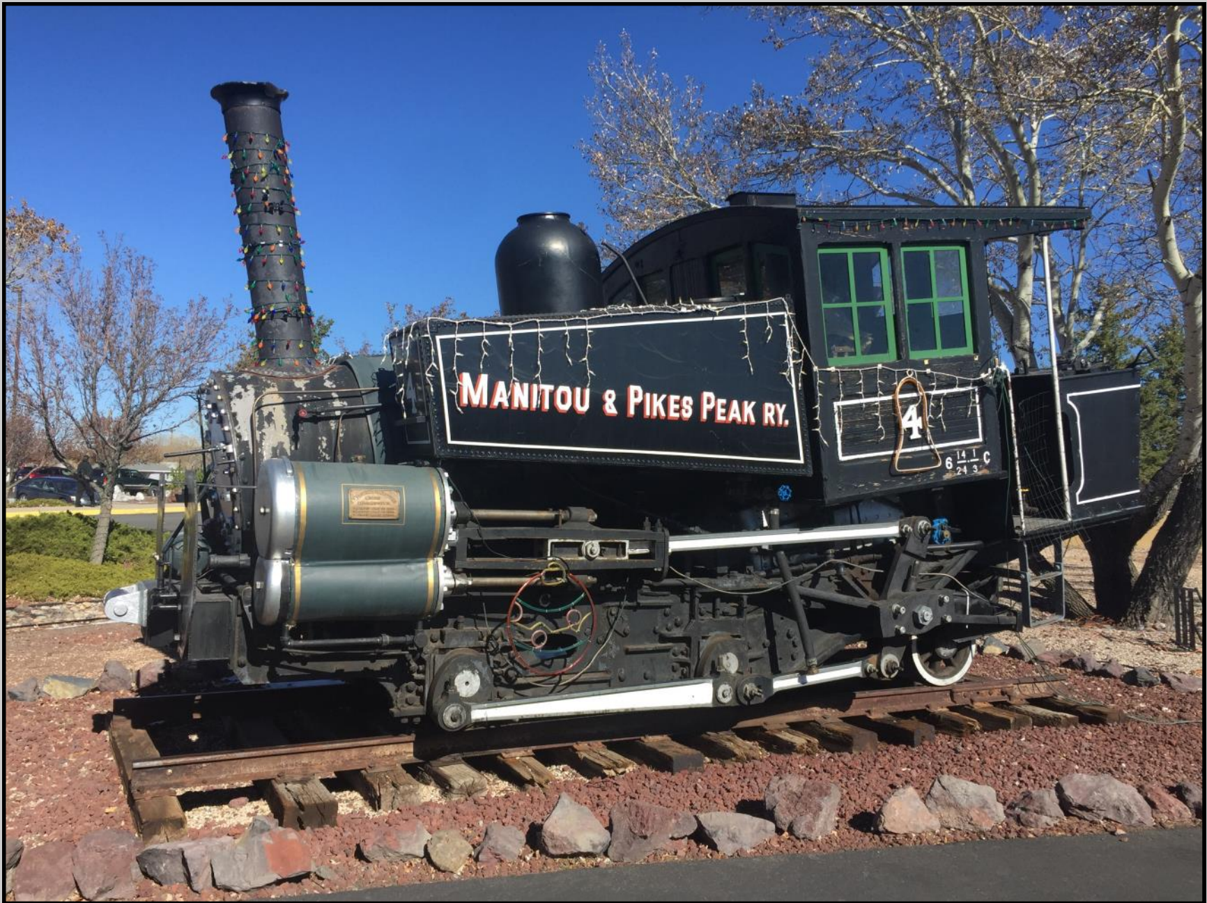
THIS WELL PRESERVED LOCOMOTIVE IS LOCATED IN WILLIAMS, ARIZONA