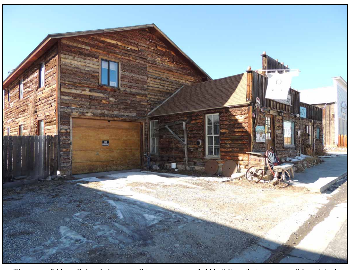
The town of Alma, Colorado has a small town museum of old buildings that were part of the original mining town, which was once called Fairplay.