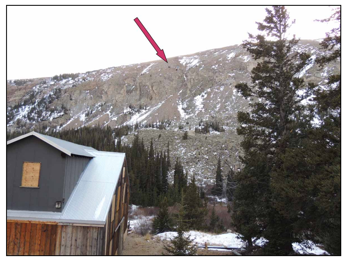
Here is an old gold and silver mine sitting on the side of a mountain. Note the rubble pile which formed a wedge shaped as the debris slid down the face of the mountain.