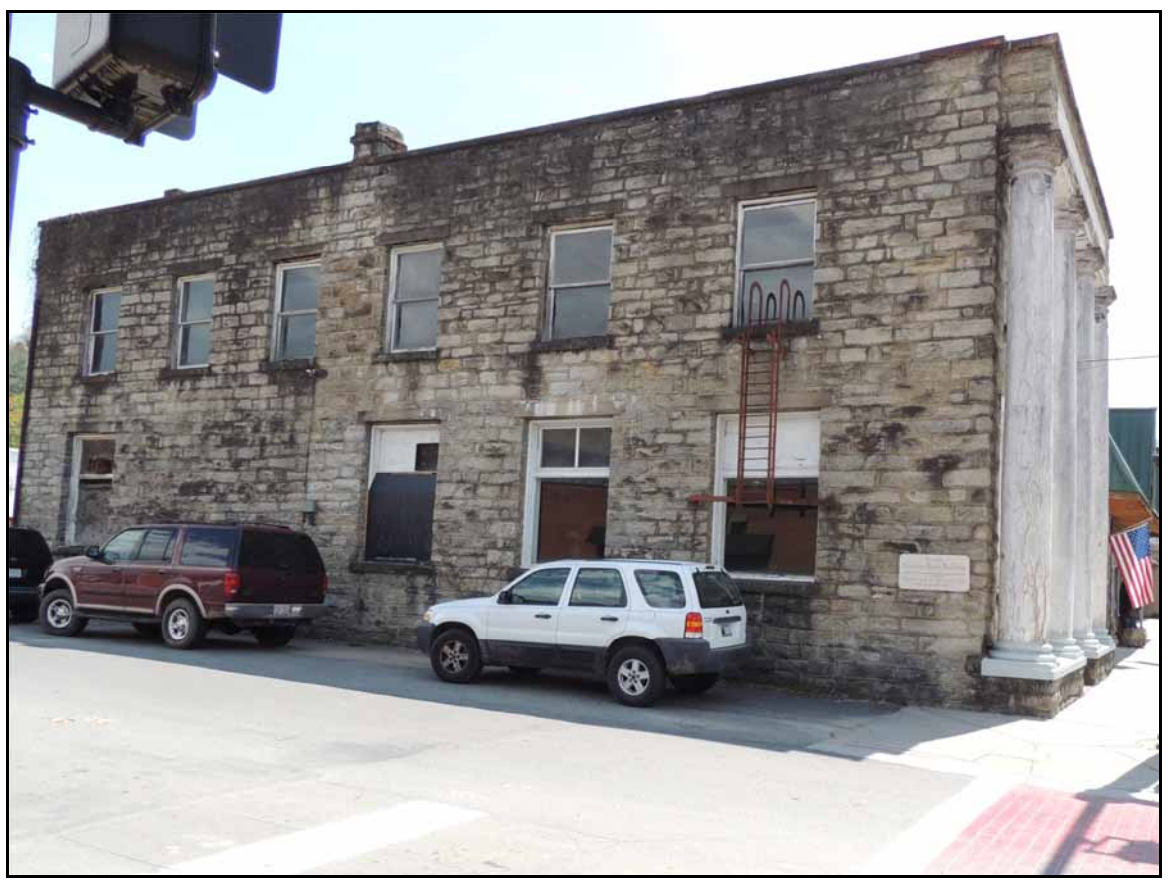
The side of the building, which does not get direct sunlight has a lot of mold and grime. It is interesting that the mold and grime is more towards the upper area of the building.