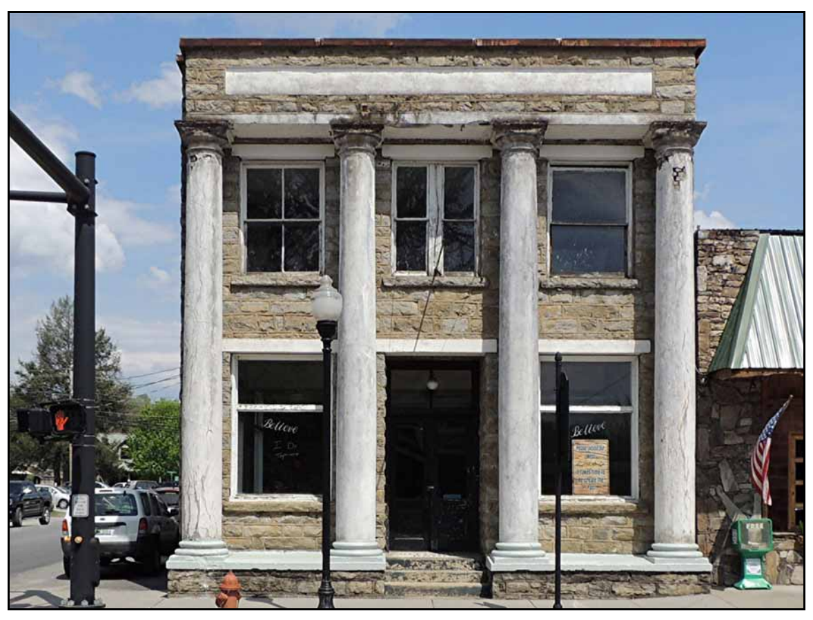
This building was the Bryson City, North Carolina bank. It is a stone building much in need of a cleaning and renovation. The front of the building faces west so it gets a lot of sun which helps keep the face of the stone clean. Note the mold and grime on the undersides of the tops of the columns.