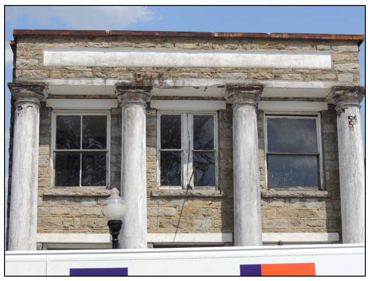
The two center columns look like solid stone, but the two outer columns, especially the one on the right tell a very different story.