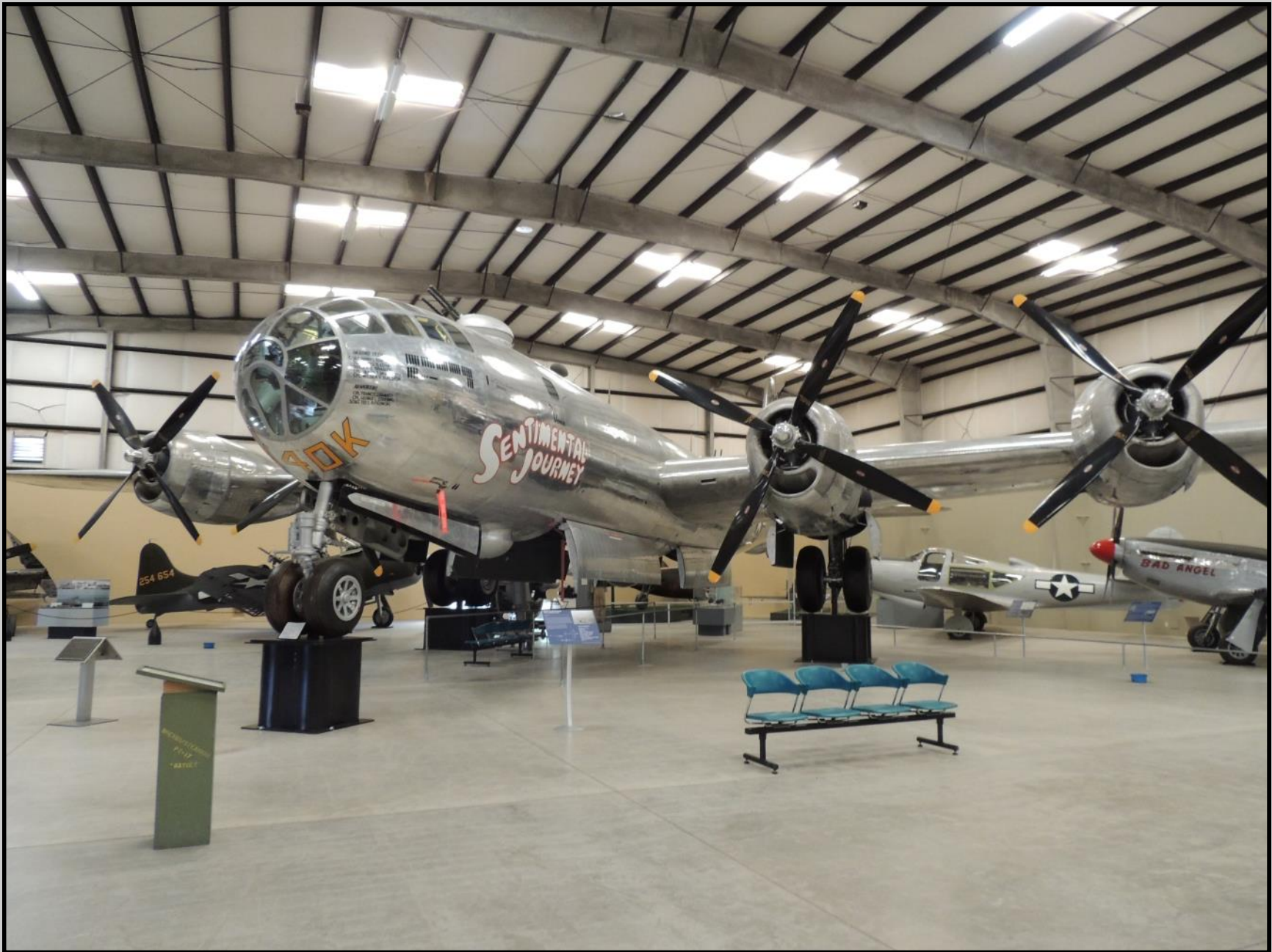
This B-29 is located at the Pima Air Museum in Tucson, Arizona.