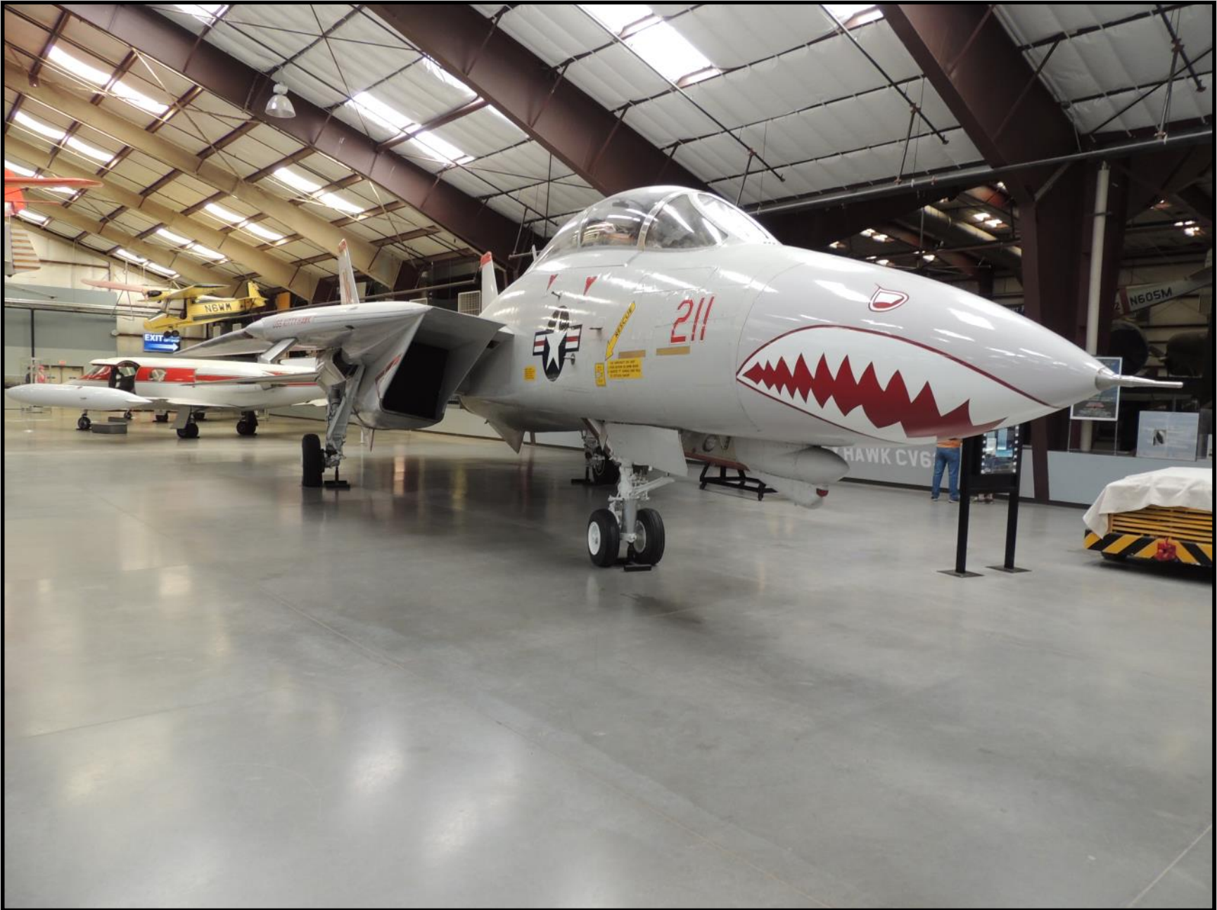
THIS F-14 TOMCAT IS LOCATED AT THE PIMA AIR MUSEUM IN TUCSON, ARIZONA